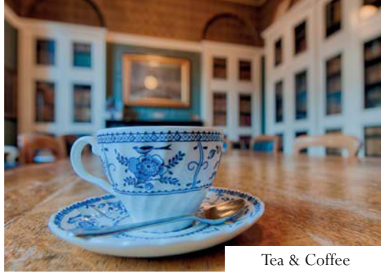
Tea & Coffee